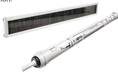
Rechargeable Battery & Solar Panel

Somfy® and Rollease Acmeda® automation systems are designed to improve your comfort, security and energy efficiency – making life easier. Our customer representatives throughout New Zealand as well as our Technical Services Manager, can consult with you or your architect at the planning stage for all domestic or commercial projects requiring automation.